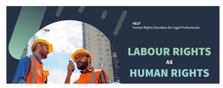
HELP Human Rights Education for Legal Professionals Council of Europe

In times of economic recession, the goal of full employment should go hand in hand with the protection of labour rights. Protecting labour rights benefits workers and their dependents and have a positive impact in their daily lives. It also benefits employers and society as it provides legal certainty in the workplace, protects the workforce and promotes sustainable growth. The benefits in terms of social cohesion and stability should not be underestimated either.